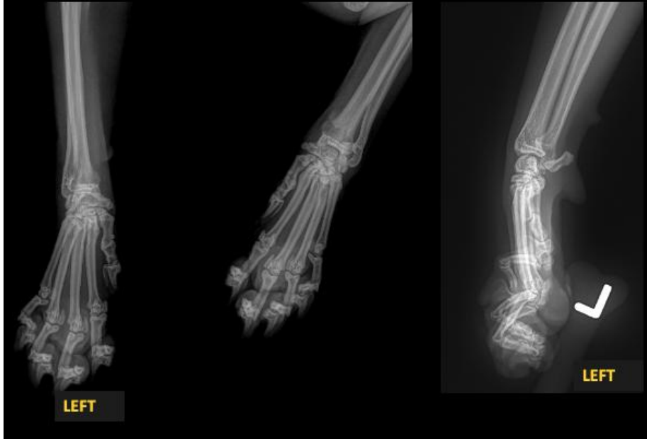
Fig. 2. Mild periarticular osteophytosis is present within the left elbow joint.