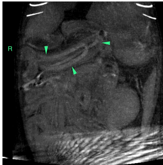
foreign material in ileum